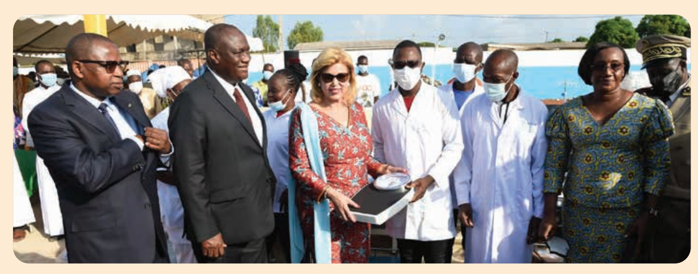
On October 28, 2021, the First Lady donated an ambulance, furniture and medical equipment to the Dominique Ouattara health center in Ferkessédougou. The donation worth 30 million CFA francs aimed at